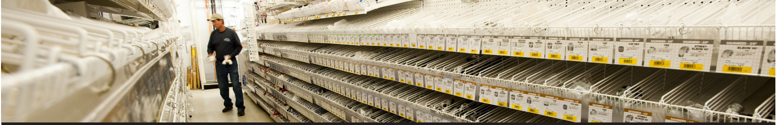
CCR Customer, Ace Hardware and Pagosa Mountain Home Company, Pagosa Springs, Colorado